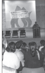
Minister to include messages on AIDS and against substance abuse in all our public addresses so that awareness reaches the people from all sides," the MLA revealed.